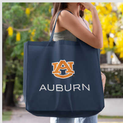
REUSABLE SHOPPING BAG