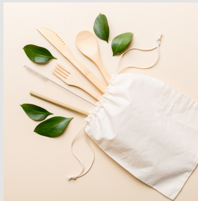
REUSABLE UTENSILS & STRAW