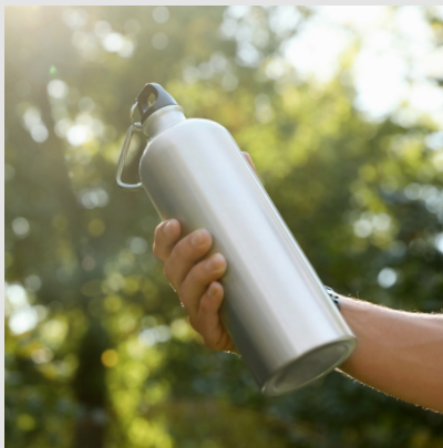
REFILLABLE WATER BOTTLE/ CUP

The right gear in your bag makes it easier to create a positive impact when out & about. So pack smart to do your part!